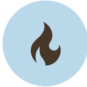
Geography (landslides, wildfire, flooding)